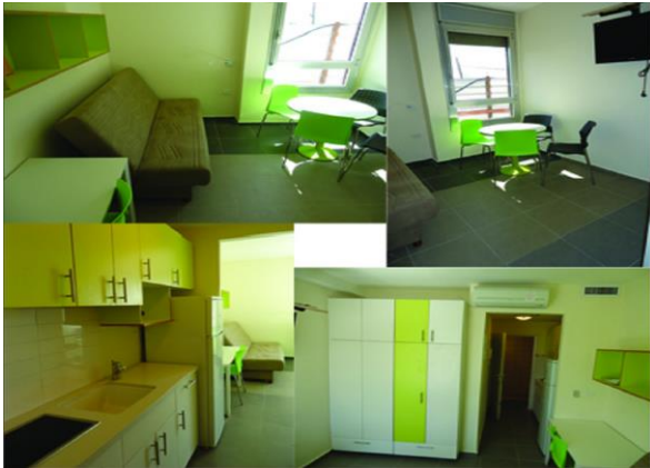
Inside the Broshim studio rooms

Fees: 800 USD per month for a studio apartment utilities and municipality tax included. Students who are living in the dorms are expected to sign a contract and pay in advance.