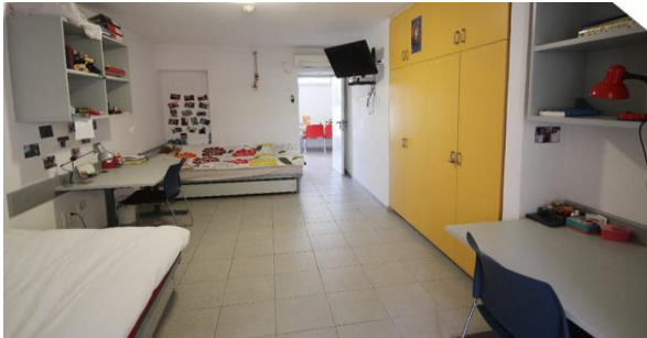
Inside an Einstein dorm room

Prices are 600 USD per month for a shared room, utilities and municipal tax included. The shared areas will be cleaned on a weekly basis. Students who are living in the dorms are expected to sign a contract and pay in advance.